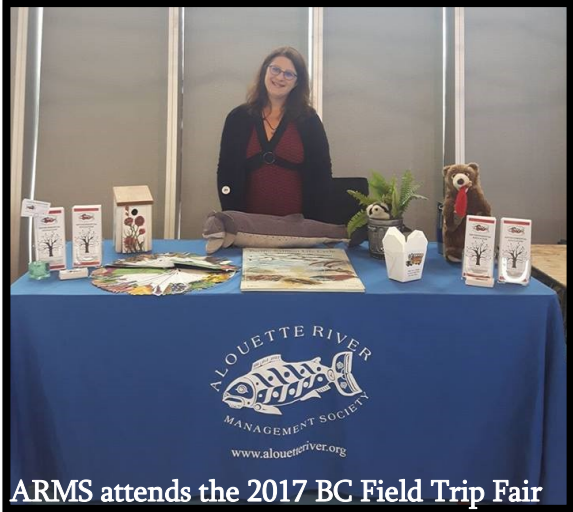
ARMS attends the 2017 BC Field Trip Fair

ARMS attended the 2017 Field Trip Fair and spoke with over 250 student teachers from UBC and SFU as well as teachers from all different local school districts. The Field Trip Fair for Teachers was created by a group of volunteers who work in the education field. They do this on a voluntary basis because they strongly believe in the value of learning both inside and outside the classroom. They believe field trips provide unique and significant learning opportunities and that by providing services they can promote field trip opportunities and they help connect teachers connect with and utilize a variety of community-based informal learning resources. For more information visit www.bcfieldtrips.ca