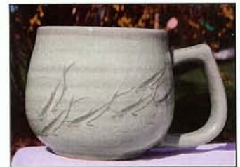
Choi's pottery mug with a salmon motif will be given to each workshop participant

stewardship organizations involved in fisheries projects are invited to come. If you have not received your invitation, contact arms@telus.net for a registration package.