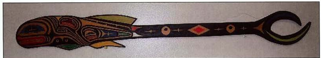
Carved and painted paddle donated by Fraser Regional Correctional Centre

For more information on the SEP workshop, visit workshop.pskf.ca/2009