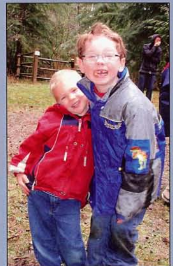
Exploring Allco Park over Spring Break, 2009

ARMS Spring Break Eco-Camp would not have possible without ARMS newest sponsor, the BC Transmission Corporation, which donated $5000 to support education programs in 2009, the BC Corrections Fraser Regional Correction Centre for their ongoing generosity of supplying many of our wood products, and also to our volunteers who helped make ARMS Spring Break Eco-Camp a huge success!