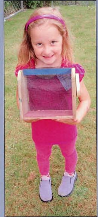
Bugs and Slugs day camper shows off her Bug Box, 2009

Alouette River Management Society 604-467-6401 armseducation@telus.net