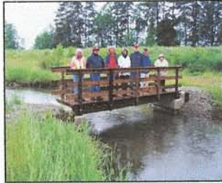
BCRP Board of Directors visit the Trethewey spawning channel, June 2008

In 2007, BC Hydro's Bridge Coastal Fish & Wildlife Restoration Program (BCRP)