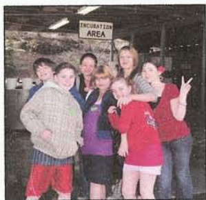
On a hatchery tour

The 12 th annual Environmental Days with Aboriginal Education from the