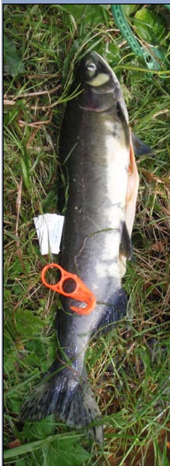
Dissecting a chum on Latimer Channel

The ARMS website, www.alouetteriver.org , was overhauled in 2007, but unfortunately, has not been kept as current as we wanted it to be. That is now changing. ARMS staff are now trained to update the website ourselves (much easier than expected!) and now you can look us up more often to see What's Up At ARMS!?!