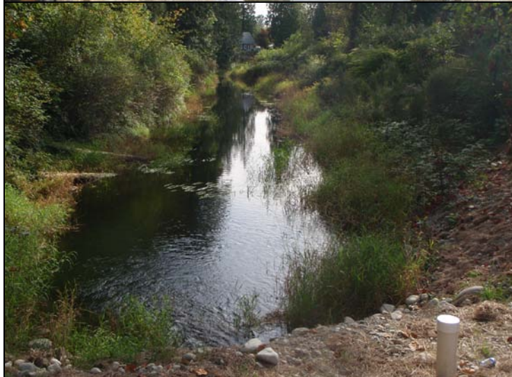
Above: 232 Street Channel retrofitted outtake with rip rap to ensure flooding will not occur and fencing to keep the beaver at bay.