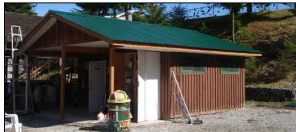
The Allco Fish Hatchery Incubation Room with a new roof. The old roof was leaking and in need of great repair to ensure damage was not done to the building interior.

the new workshop building and installation for a new generator, which will be running by the spring of 2012. ARMS and the Allco Fish Hatchery would not be able to run our programs to the same capacity without the support of PSF.