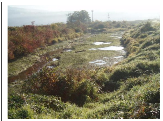
View of the North Alouette main stem almost completely dewatered, November 2006

For more information regarding these events please visit www.savethealouette.ca