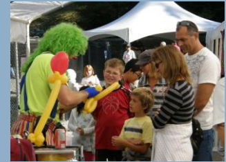
Ridge Meadows Rivers Day, September 2009

Be sure to come to the Rivers Heritage Centre this summer and try our new self-guided tour of Allco Park. ARMS staff created a map of the park to highlight the many natural and historic features this green space has to offer. Walkers, outdoor enthusiasts, naturalists, explorers, and more will appreciate the educational experience.